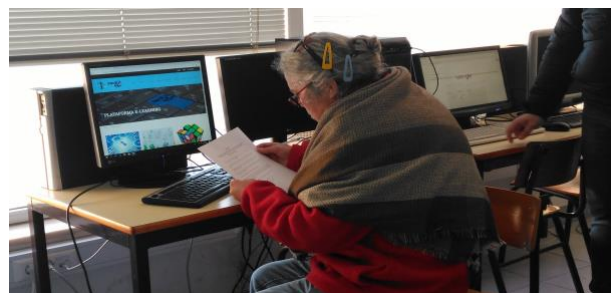
In the pictures above some of the Face to face session carried out in the partners countries.